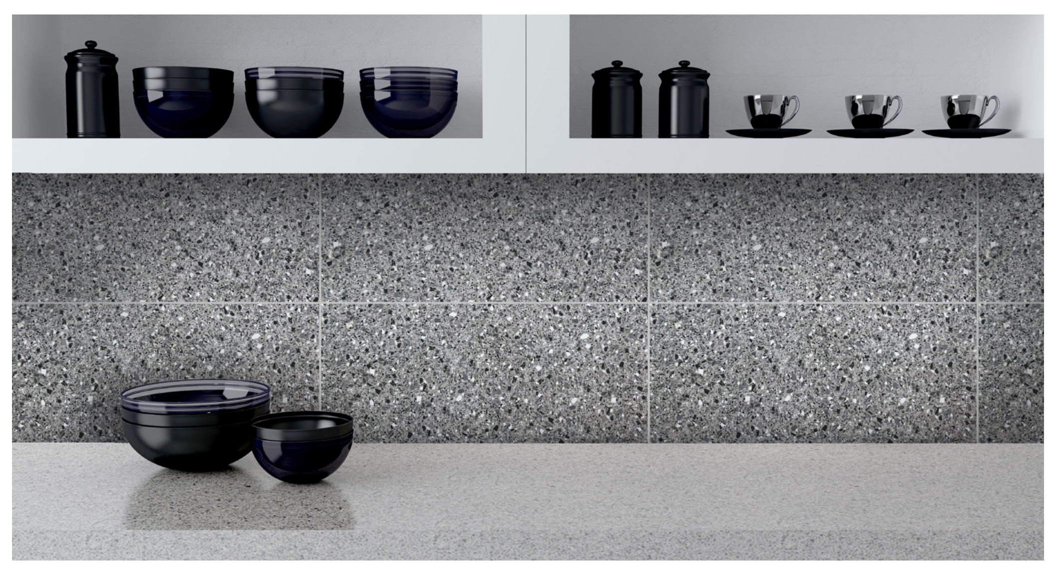
Variation is an inherent property of tiles and stone. Sizes are nominal and may include a joint.